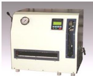
Plate Size : 110 x 305 mm